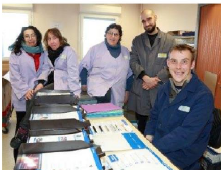
The ESAT Du Valois team is very proud that their SP marketing literature assembly work reaches all parts of the globe.