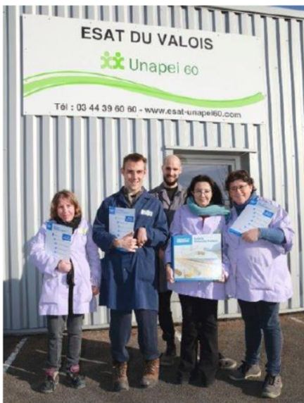
The workers at ESAT Du Valois located near our Crepy, France plant assemble our marketing literature.